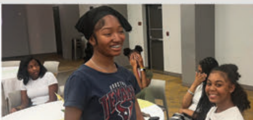
TEEN GIRLS LOCK-IN (COLLABORATION WITH FOUNTAIN OF PRAISE!)