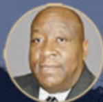
MINISTER TROY JOHNSON