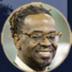
MINISTER CRAIG BARNETT

MANHOOD · MINISTRY · MINDSET SAT | JUL 20 | 11:30AM | THE KBC